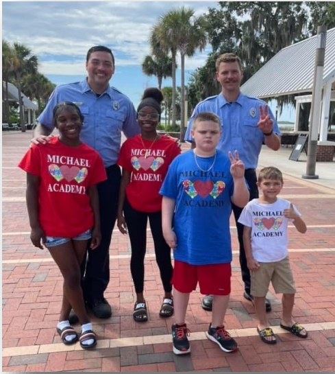
2022 TEAM KAREEM WATER SAFETY EVENT