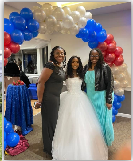
2021 DEBRTE FROM THE SILHOUETTES OF CRITERION